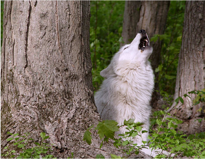
Photo: Atka howling