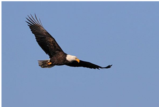
Photo 5. A new Rockland CBC record was established for Bald Eagle, most were from the Lake Tappan area.