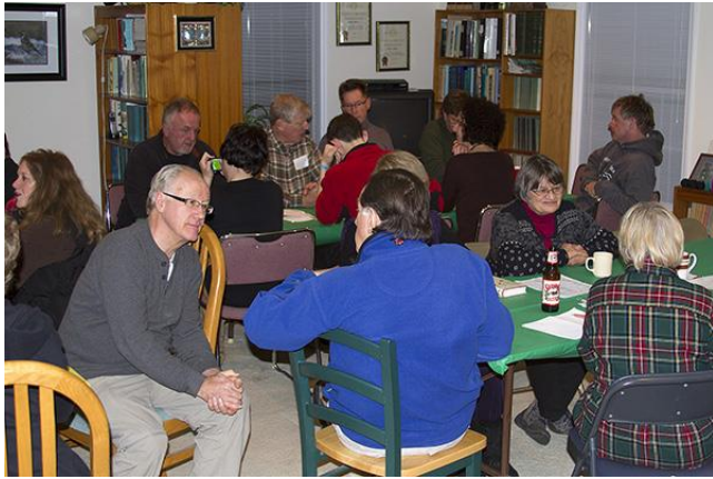
Photo 8. Some of the counters at the countdown potluck dinner.