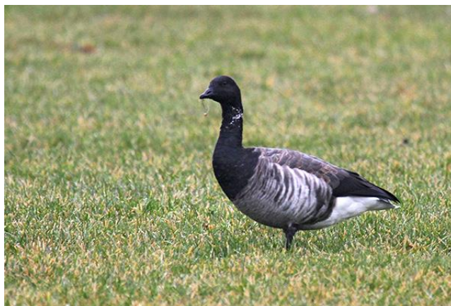
Photo 2. One of four Brant found in Haverstraw Bay County Park.