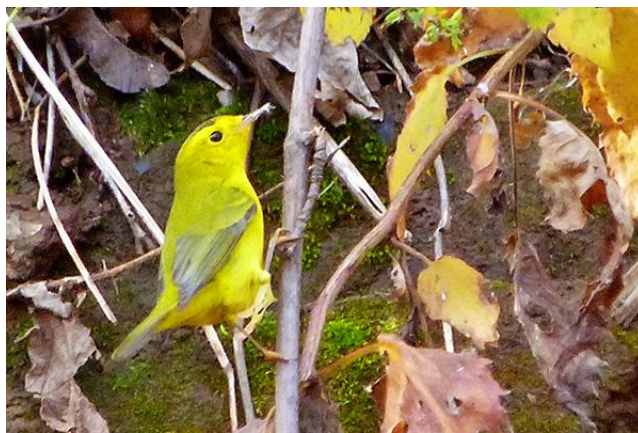
Photo 1. Wilson's Warbler found in near Piermont, a Rockland CBC first!

Barred Owl – a freshly killed individual found on the road near Haverstraw Bay County Park. This species was previously unknown from this area of the County.