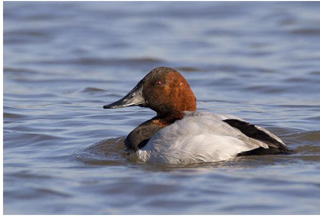
Photo 3. Canvasback, typically one of the most abundant species, was nearly absent this year.