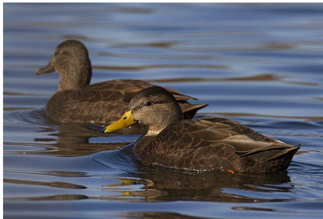
Photo 4. Two of 25 American Black Duck from Letchworth Village, Area 1.