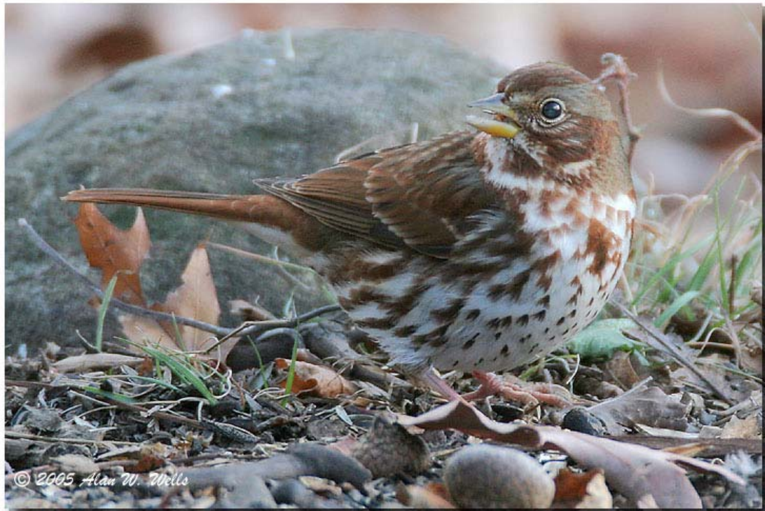
Photo 5. Fox Sparrow was seen in only three districts and at one feeder.