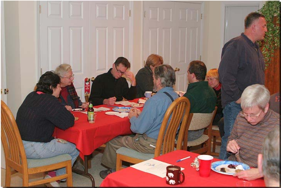
Photo 9. Part of the crowd at the Count Down Pot Luck Dinner. Some hard at work on compiling results, others hard at work compiling dessert!