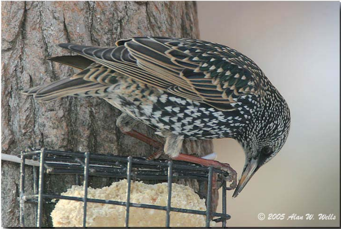
Photo 2. Back by popular demand, this year's top recorded species was European Starling.