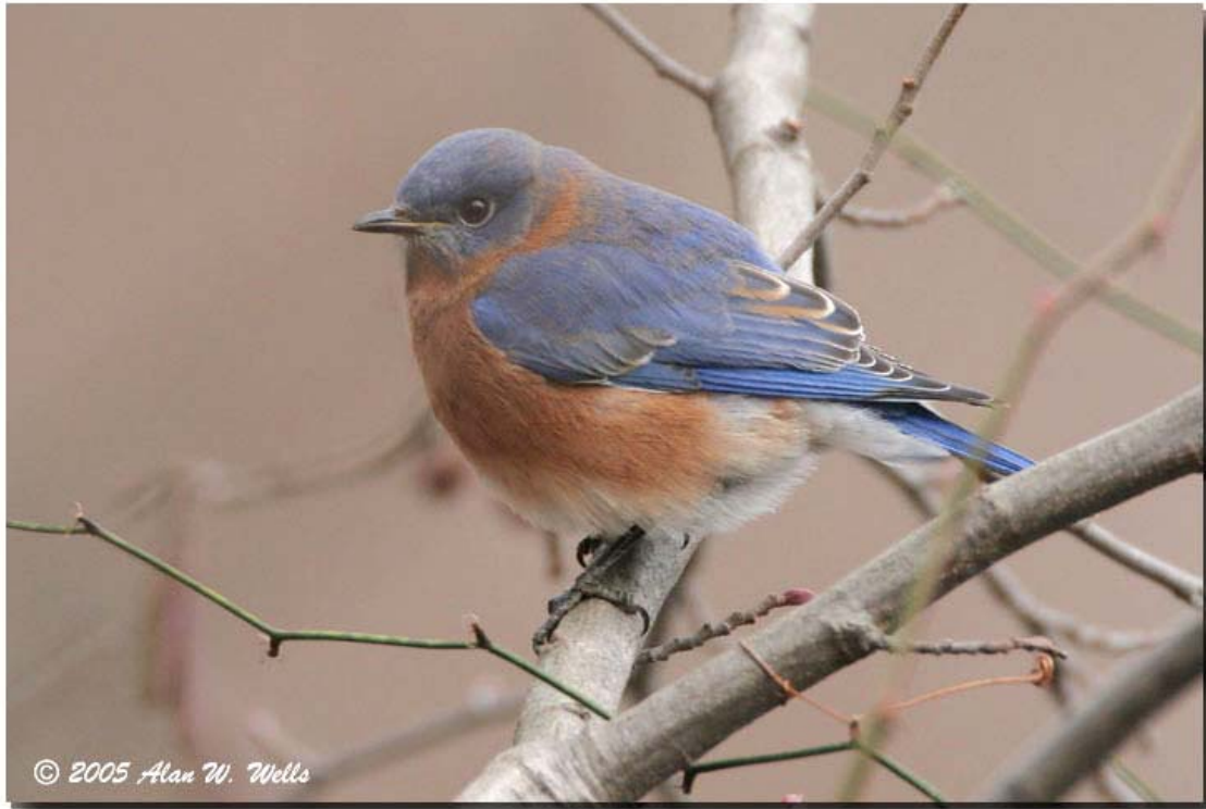
Photo 6. Six Eastern Bluebirds at Letchworth Village were a fortunate find for the Haverstraw-Stony Point team.