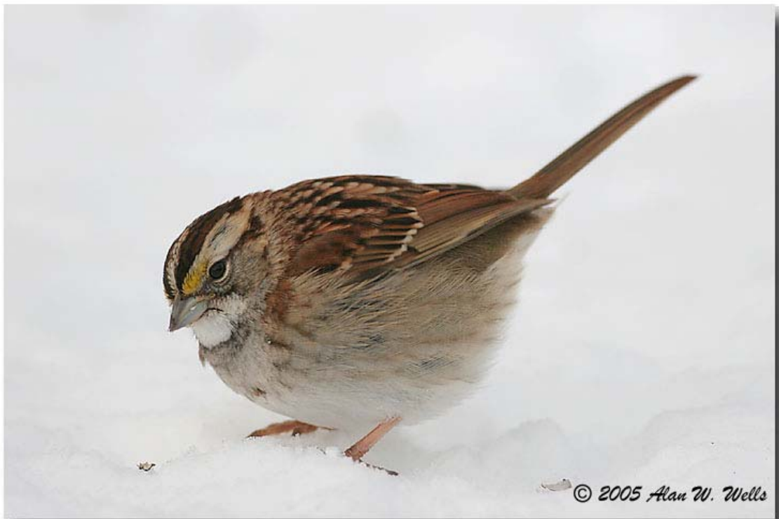
Photo 7. White-throated Sparrow was reported from all nine districts.