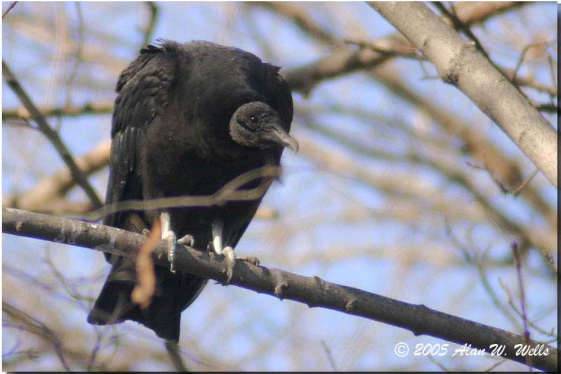
Photo 4. The fifteen Black Vultures recorded in the Haverstraw-Stony Point district was a new high for this species.