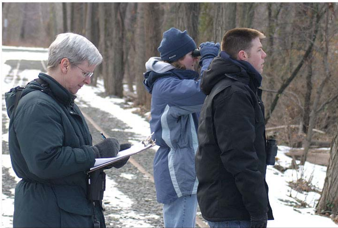
Photo 1. Haverstraw-Stony Point team checking Haverstraw Bay County Park.

The highlight of the day for the West Orangetown team was the peregrine falcon attack. The unfortunate dove (?) exploded in a cloud of feathers. The highlight of the day for the Haverstraw-Stony Point team was attacking the new Kickin' Burgers at Hogan's Dinner. It may not have been a healthy lunch choice, but it was certainly a tasty choice!