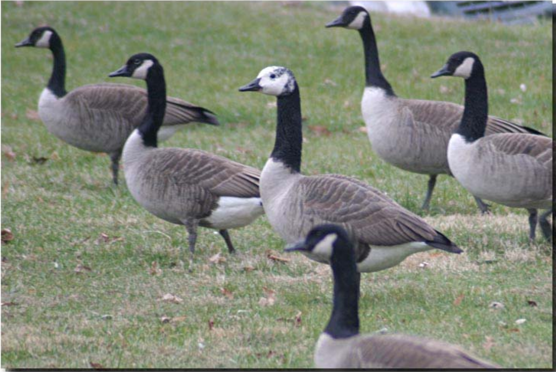
Photo 2. Topping this year's list, SURPRISE!, Canada Goose (plus 1 odd duck).