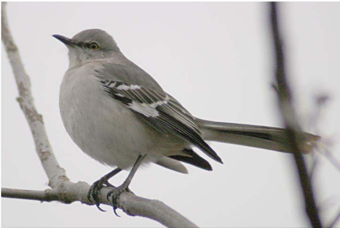
Photo 4. Northern Mockingbird standing guard at Haverstraw Bay County Park.