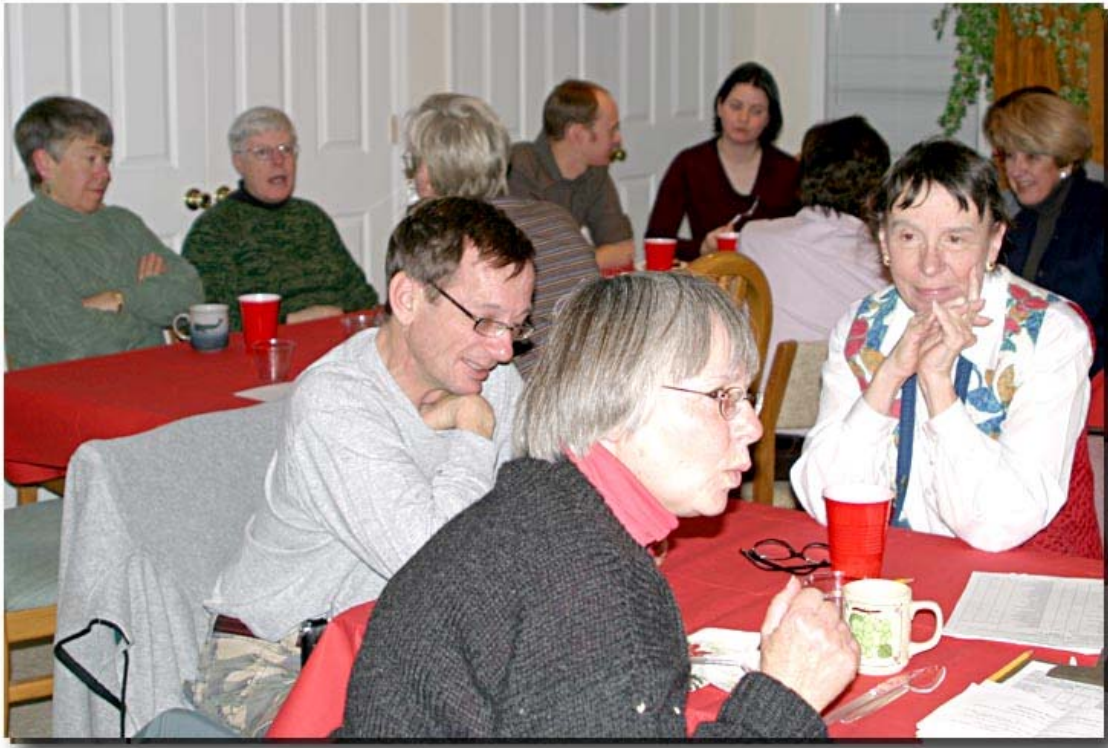
Photo 9. Part of the crowd at the Count Down Pot Luck.