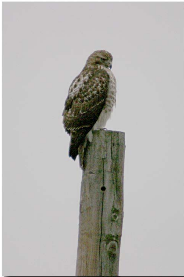
Photo 8. Red-tailed Hawk at the Haverstraw Landfill.