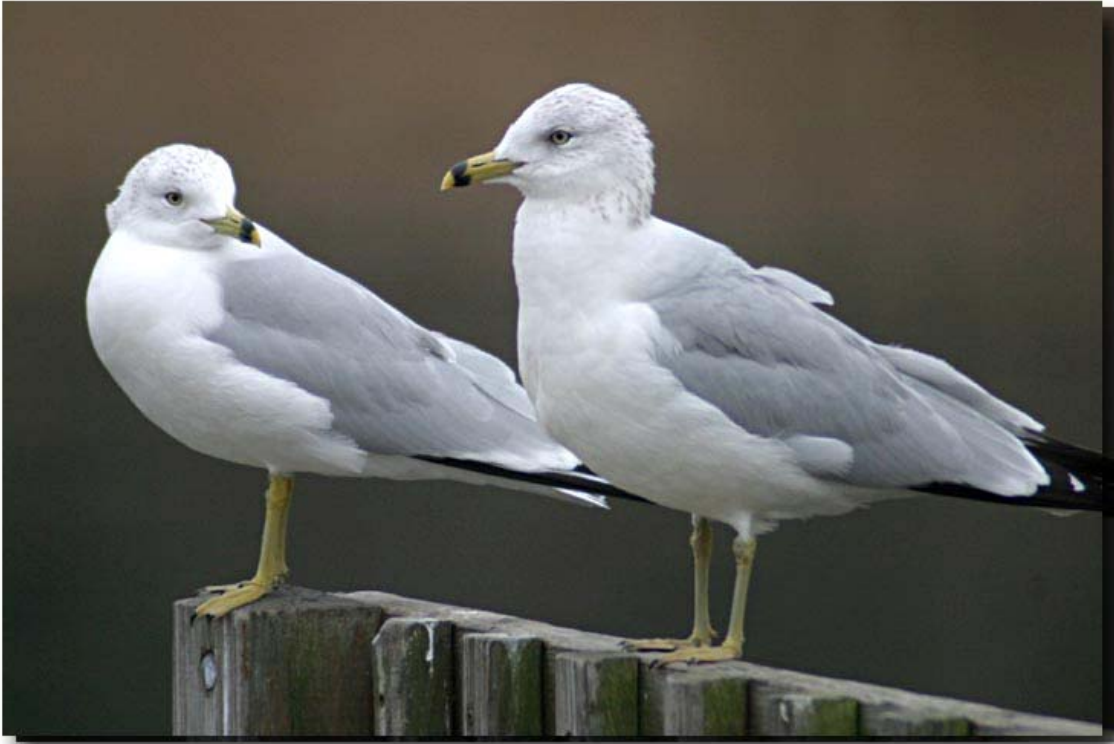
Photo 5. Ring-billed Gull was the fifth most abundant species, “Simile Ralph, we’re about to be counted”!