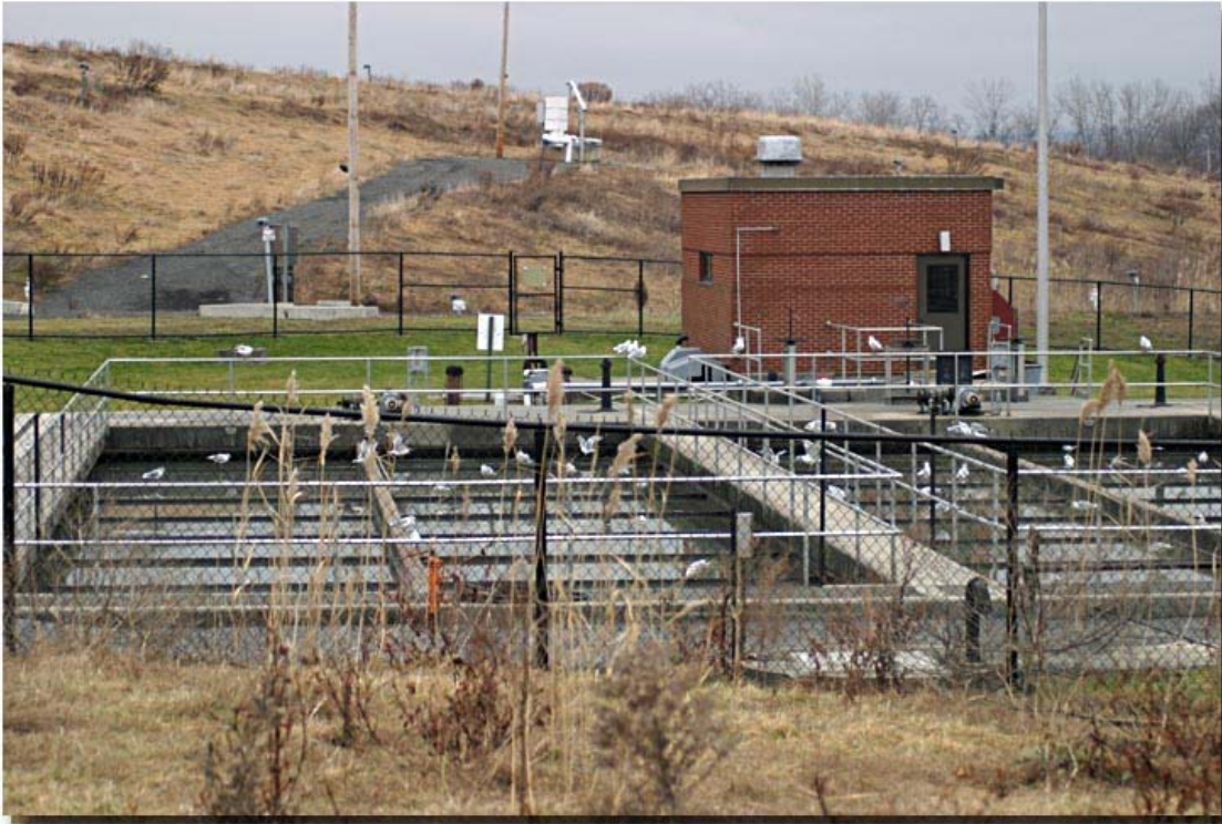
Photo 3. Counting Ring-bills at the Sewage Treatment Plant. OK, it's not all fun and games!