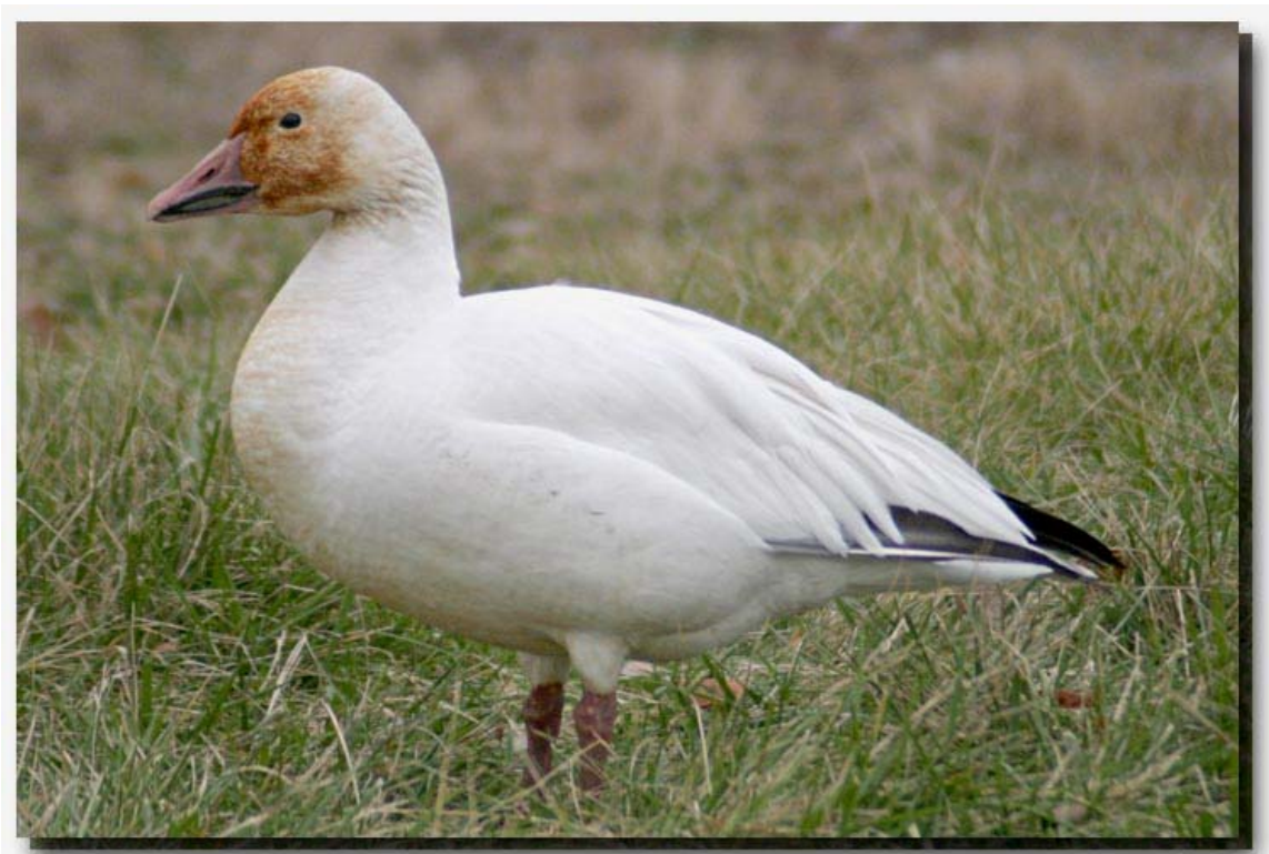
Photo 7. A lone Snow Goose intermixed with a small flock of Canada Geese at Willow Cove Marina.