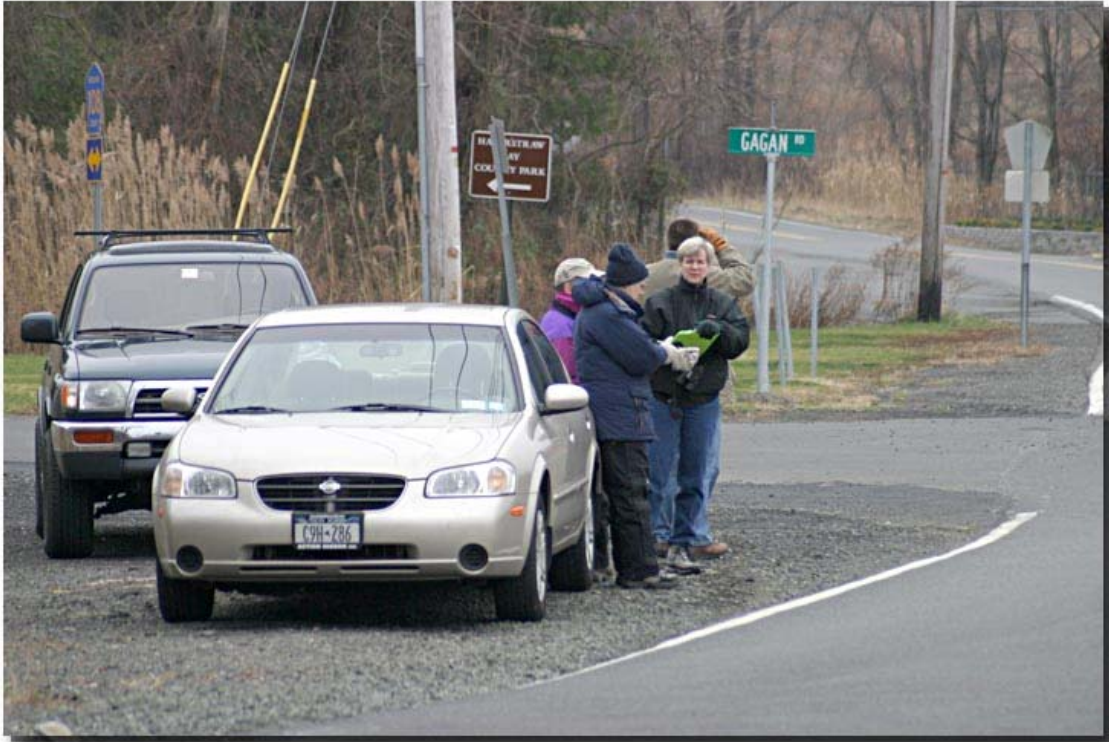
Photo 1. North Rockland Counters waiting for access to the Haverstraw Landfill.