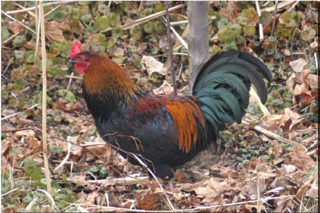
Photo 6. The free-range roosters at Haverstraw Bay County Park didn’t make the count.