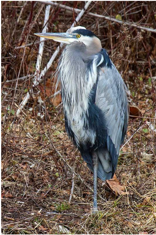
Photo 2. While primarily a summer bird, Great Blue Heron are found almost every CBC since the late 1970s. Photographed at Haverstraw Bay County Park (District 1). (Photo: Alan W. Wells).