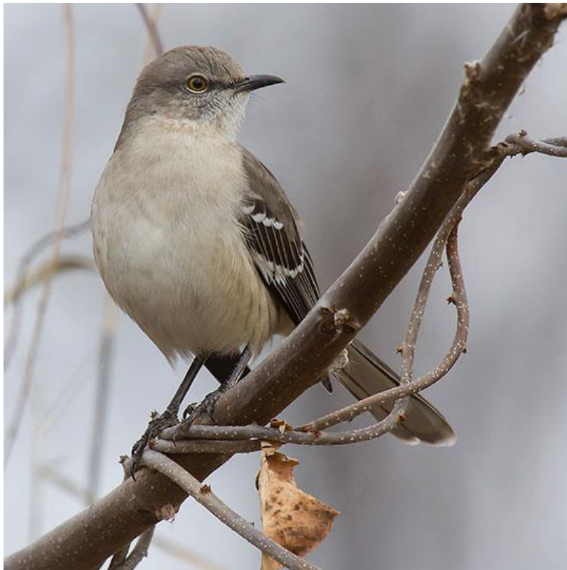
Photo 1. Northern Mockingbirds were found in every District, 70 in all.