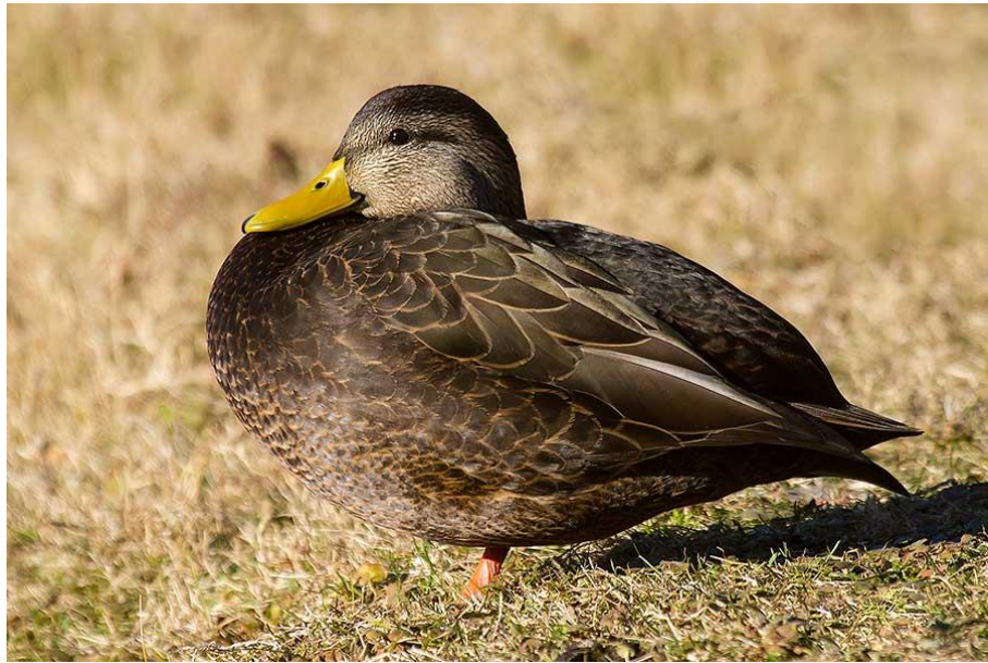
Photo 6. One of the three American Black Ducks found at Peck's Pond (District 1).