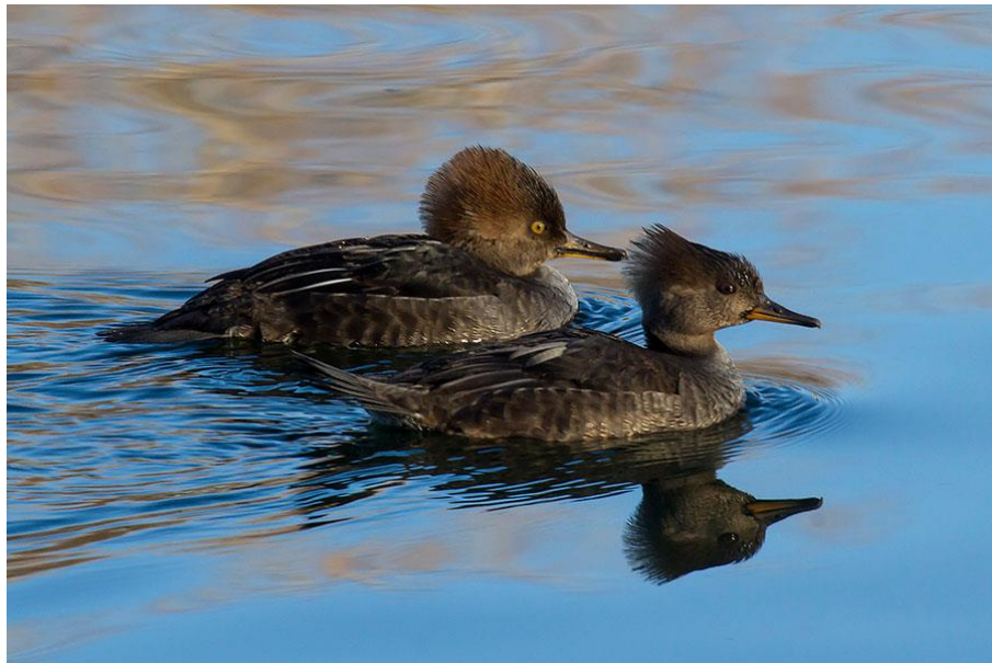
Photo 5. Two female Hooded Mergansers found on the Haverstraw Bay County Park fishing pond (District 1). Nine were present on the pond.