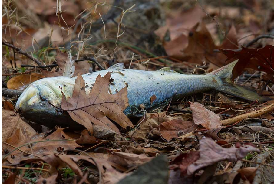
Photo 4. A sure sign that Bald Eagle are around are dead bunker (Atlantic Menhaden) found far away from the Hudson River.