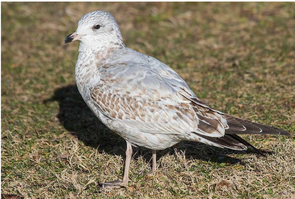
Photo 2. First winter Ring-billed Gull at Peck's Pond on December 19 (pre-count). Ring-billed Gulls were fifth most abundant species on Count Day.