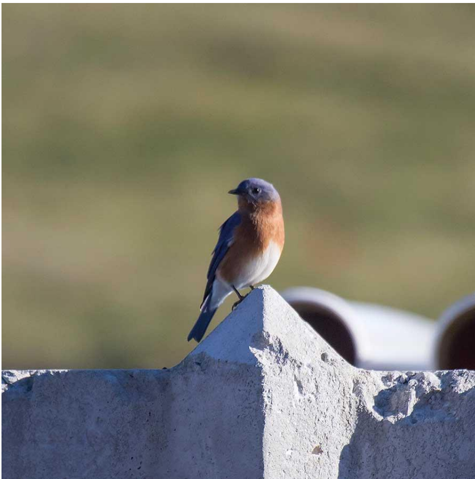
Photo 4. Eastern Bluebird was common until 1960, then it largely disappeared. It is now making a comeback with this year's 16 birds the most seen since 1959. (Photo: Alan W. Wells).