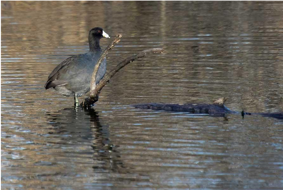
Photo 3. American Coot is typically common on Rockland Lake during ice free periods, but uncommon to rare throughout the rest of the county. We were surprised to find this individual at the fishing pond in Haverstraw Bay County Park. (Photo: Alan W. Wells).