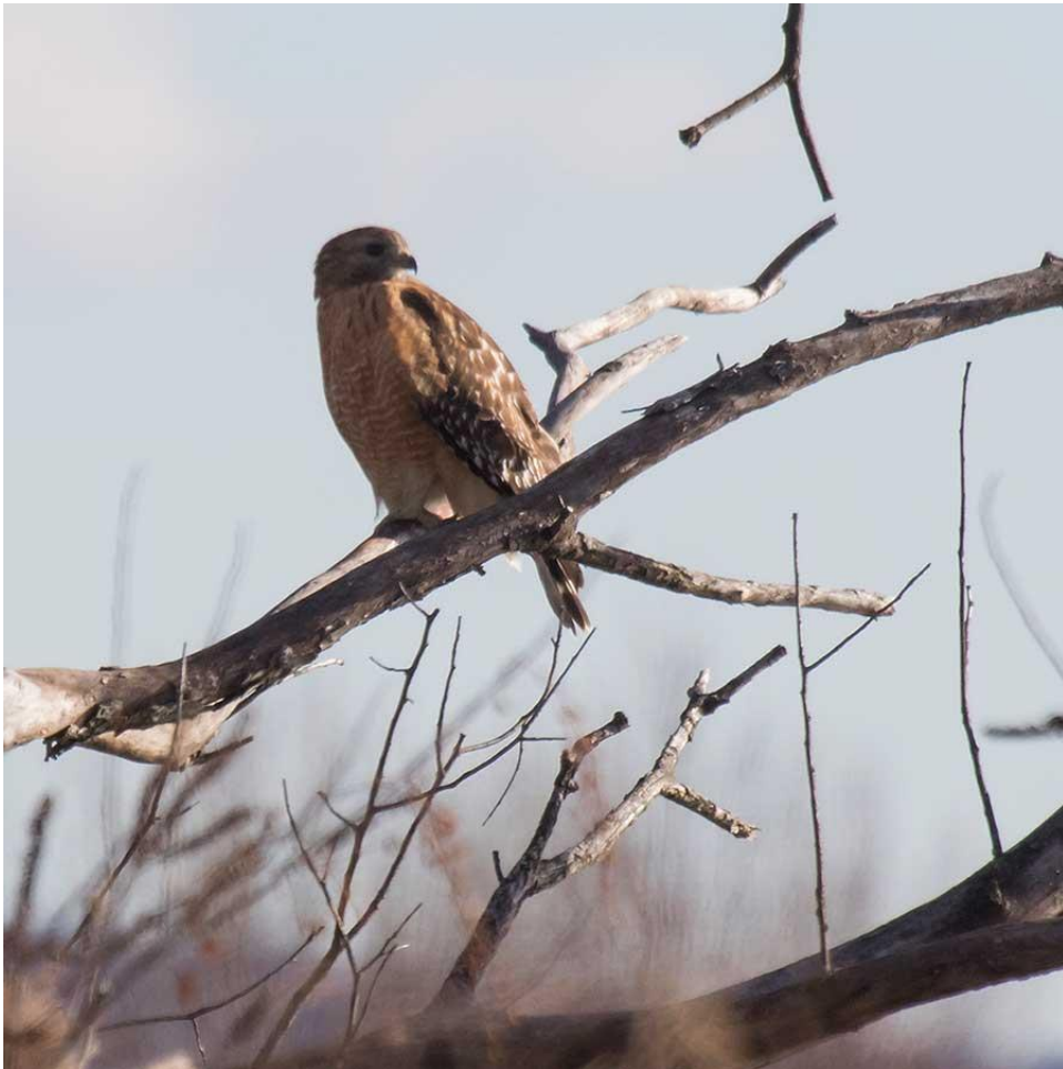
Photo 1. Red-shouldered Hawk at Bowline Pond on December 19, 2015. This species has been rare on counts since the mid-1970s. We were unable to relocate it on Count Day.