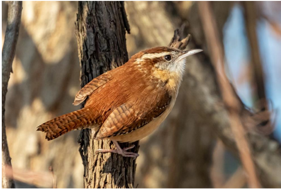
Photo 3. Carolina Wren is another species increasing in the Lower Hudson Valley. It was relatively uncommon on the RAS CBC until the late 1980s, when its abundance began to rise steadily. The previous high of 59 in both 2006 and 2019 was almost doubled to 92 in 2020. at Haverstraw Bay County Park on December 21, 2020.