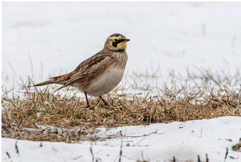
Photo 5. A nice Count Day find by the District 1 team was the flock of about 25 Horned Lark at the Haverstraw Landfill.