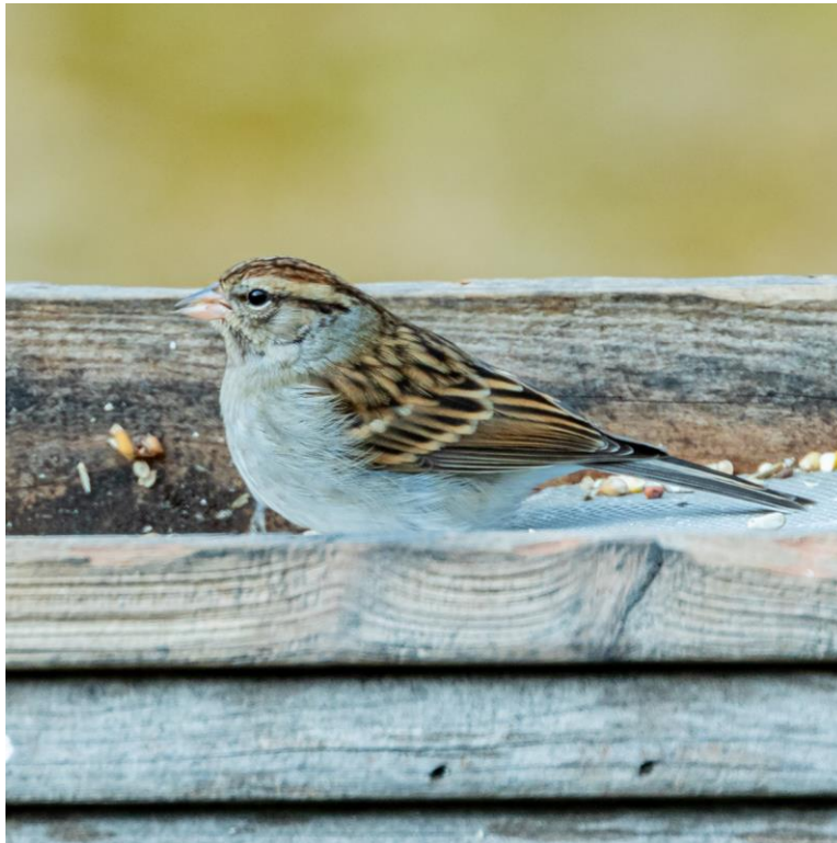
Photo 6. Scattered reports of Chipping Sparrow occurred with surprising frequency this winter. One individual was found feeding with juncos in the Rockland Community College parking lot on Count Day by a District 2 team. Had this species not been found on Count Day, several more were reported during Count Week. This one was photographed in a feeder in Tomkins Cove on January 4, 2021 by Alan Wells.