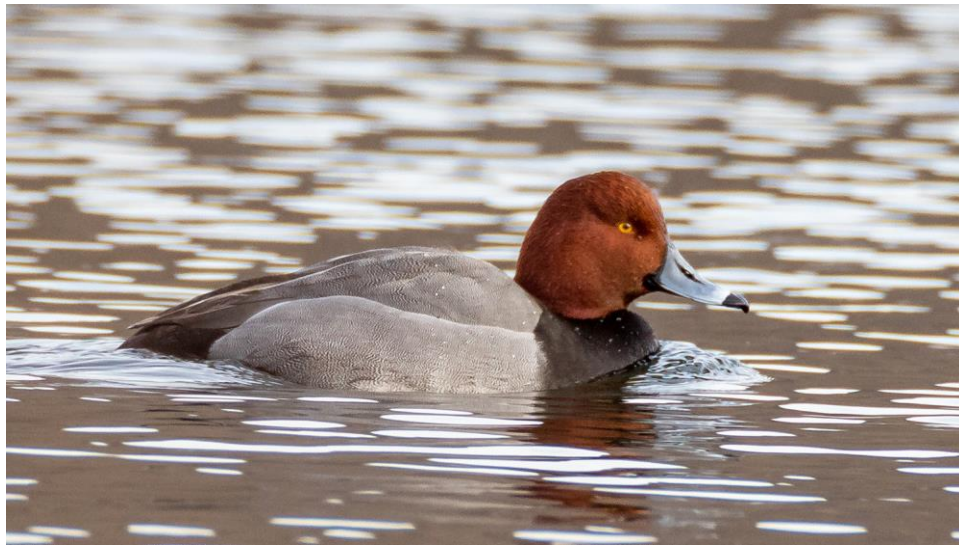
Photo 5. One of the elusive trio of Redheads (two males and one female) that inhabited Rockland Lake before and after the RAS CBC. This male was seen and photographed on December 30, 2020 by Alan Wells.