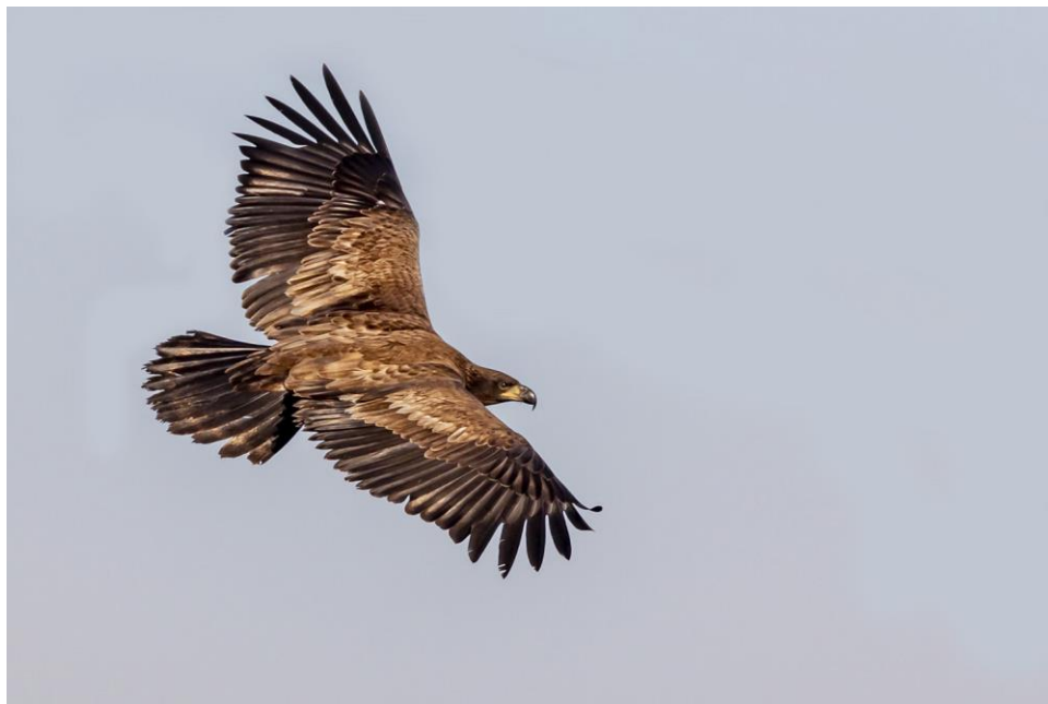
Photo 2. Bald Eagle numbers throughout the Lower Hudson Valley continue to rise. This year's high count of 53 handily surpassed the previous high of 44 established in 2012. The above first winter bird was photographed by Alan Wells at the Stony Point Battlefield State Historic Site on January 8, 2021.