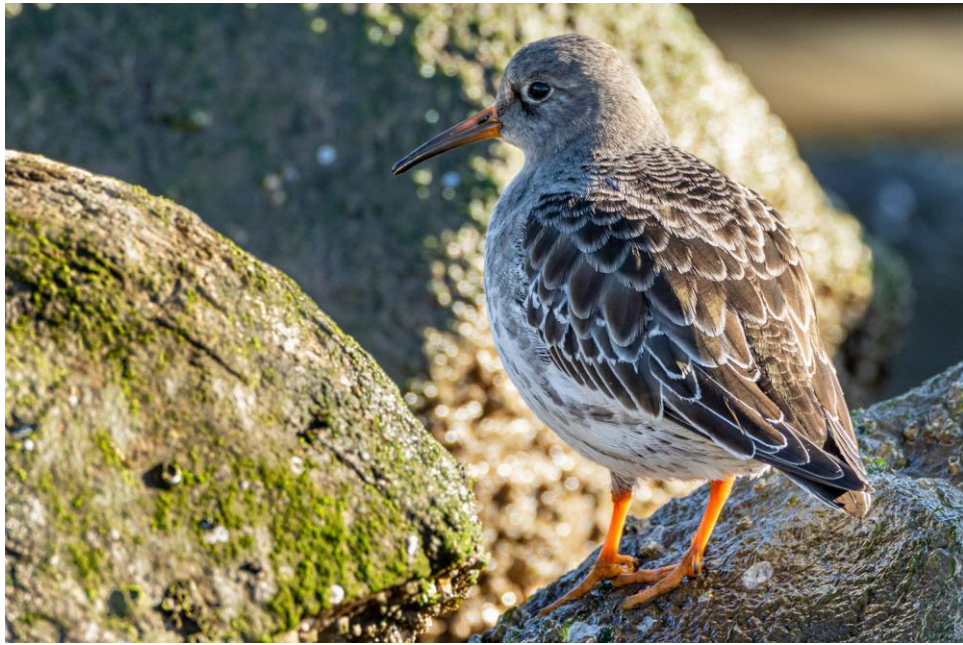
Photo 1. Purple Sandpiper is a costal species rarely seen as far inland as Rockland Co. The District 9 team discovered two at Piermont Pier on Count Day. These two individuals have been seen more or less consistently from that date to the time of this writing, January 11, 2021. The above photo was taken on January 6, 2021.