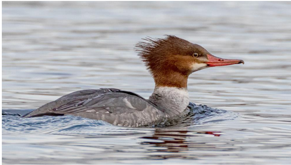
Photo 4. Large numbers of Common Merganser congregate in large open waterbodies of the Lower Hudson Valley during winter until freeze up occurs. The pre Count Day Nor'easter resulted in an early freezing of several large waterbodies, likely resulting in the lower than typical count for this year. This adult female Common Merganser was photographed by Alan Wells at Rockland Lake on December 30, 2020 after the lakes began to reopen.